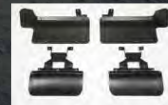
Mud guard (Front / Rear)