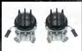
Front work light