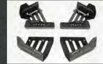
A-arm guard (Front / Rear)