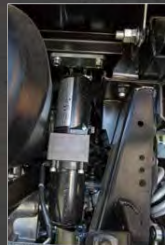
Electric hydraulic bed lift kit (left: dump switch / right: lift cylinder)