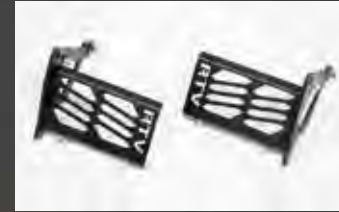
Tail lamp guard