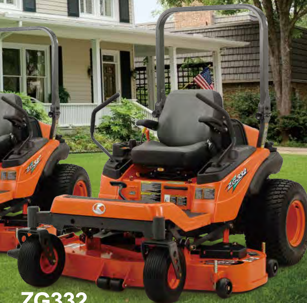
ZG332 with 72" deck