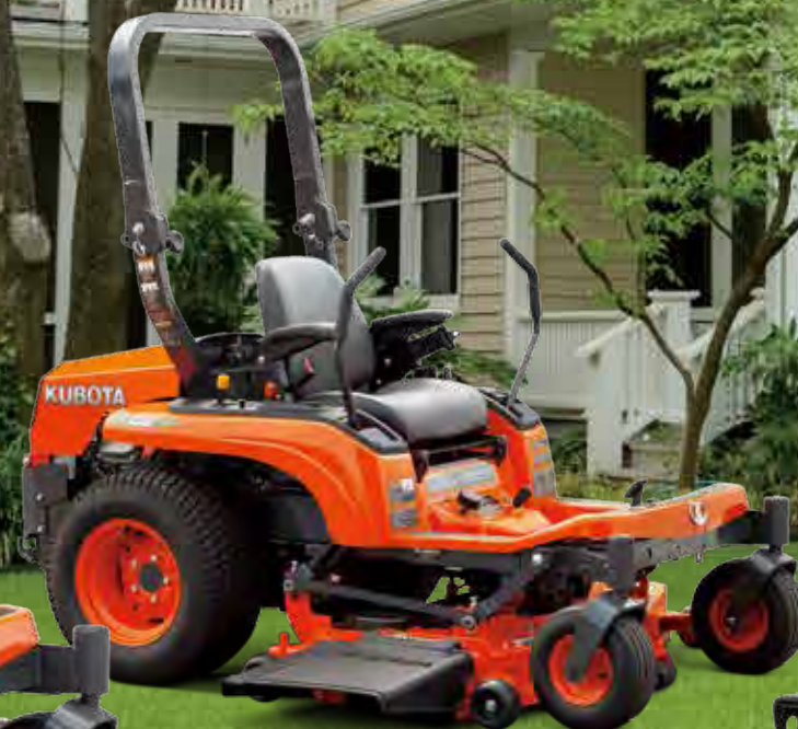
ZG222 with 48" deck