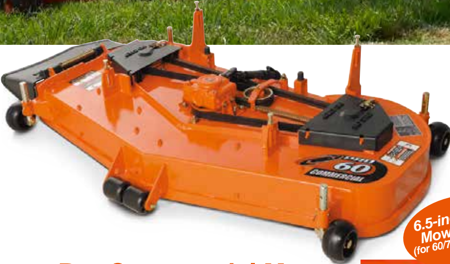
6.5-inch Deep Mower Deck (for 60/72 inch Decks)