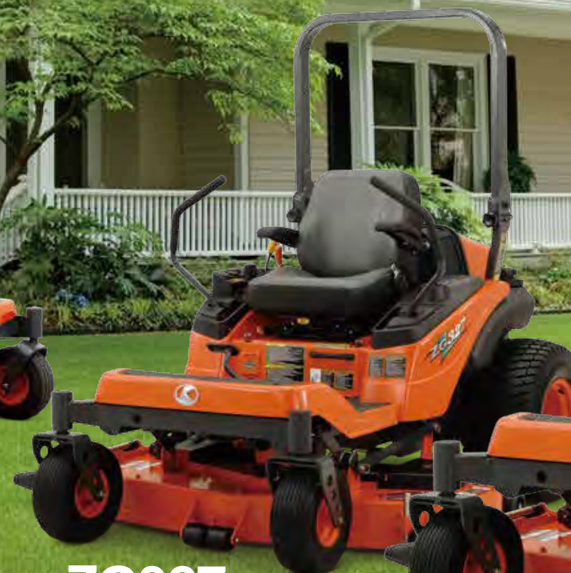
ZG327 with 60" deck