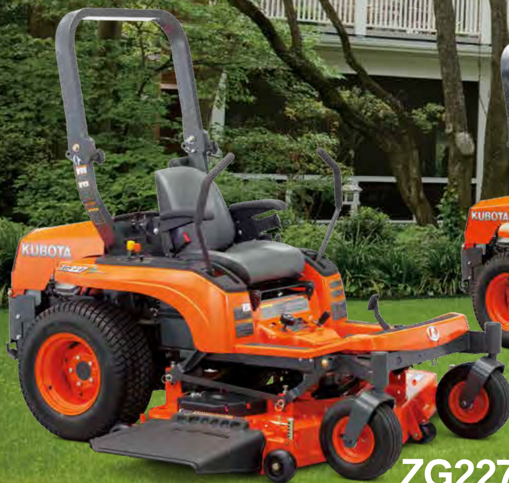
ZG227 with 54" deck

If you're looking for an efficient, easy-to-use, high-performance mower that produces immaculate results every time, then Kubota's ZG-Series zero-turn mowers were made for you. With the ZG-Series' main components, the state-of-the-art Kubota petrol engine, the reliable Kubota HST transmission and Kubota Pro Commercial mower decks, made by a single manufacturer, these zero-turn mowers are truly one-of-a-kind in the industry. This solid combination of commercial-quality components is what makes the ZG-Series deliver the performance you've been looking for.