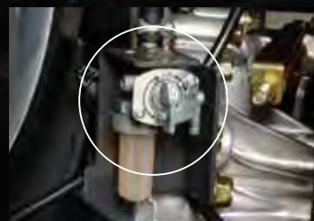
Carburetor Drain Cock*

*When in use, consult operator manual and handle with care.