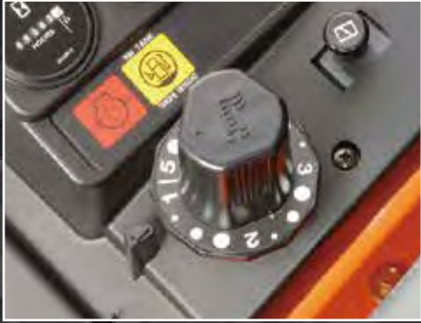
1/4" Increment Cutting Height Adjustment