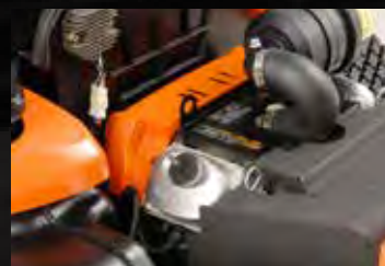
Removable Engine Cover

*When in use, consult operator manual and handle with care.